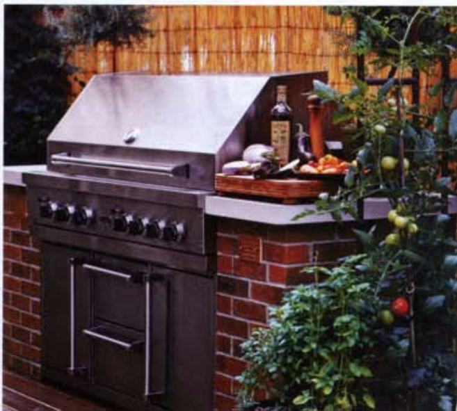
RIGHT: Brickwork and stone provide a built-in frame for the Viking grill and a base for limestone countertops.